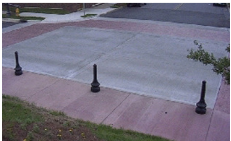
raised intersection example