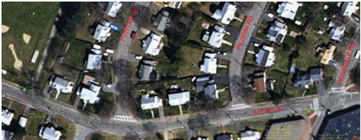
conduit layout (in green)